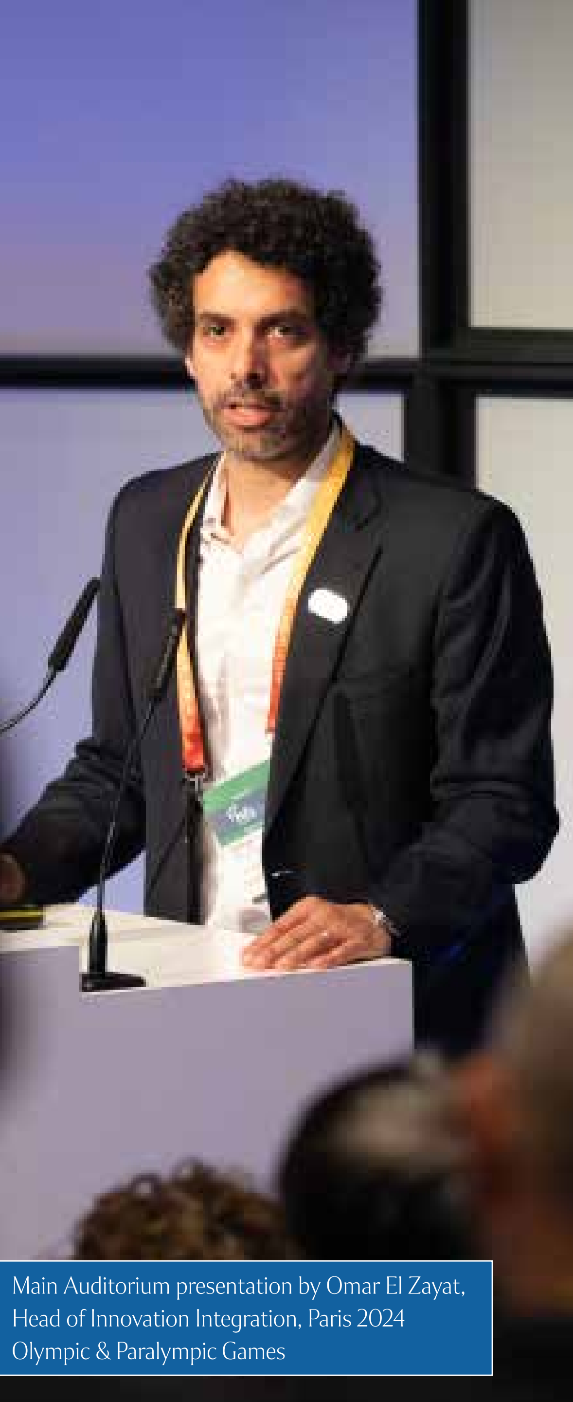
Main Auditorium presentation by Omar El Zayat, Head of Innovation Integration, Paris 2024 Olympic & Paralympic Games