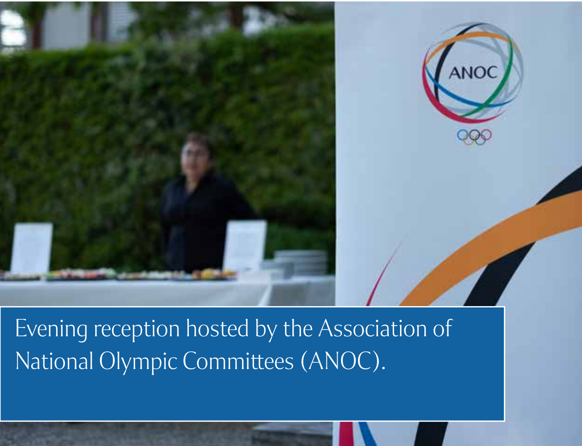
Evening reception hosted by the Association of National Olympic Committees (ANOC).