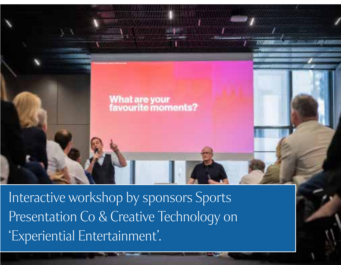
Interactive workshop by sponsors Sports Presentation Co & Creative Technology on 'Experiential Entertainment'.