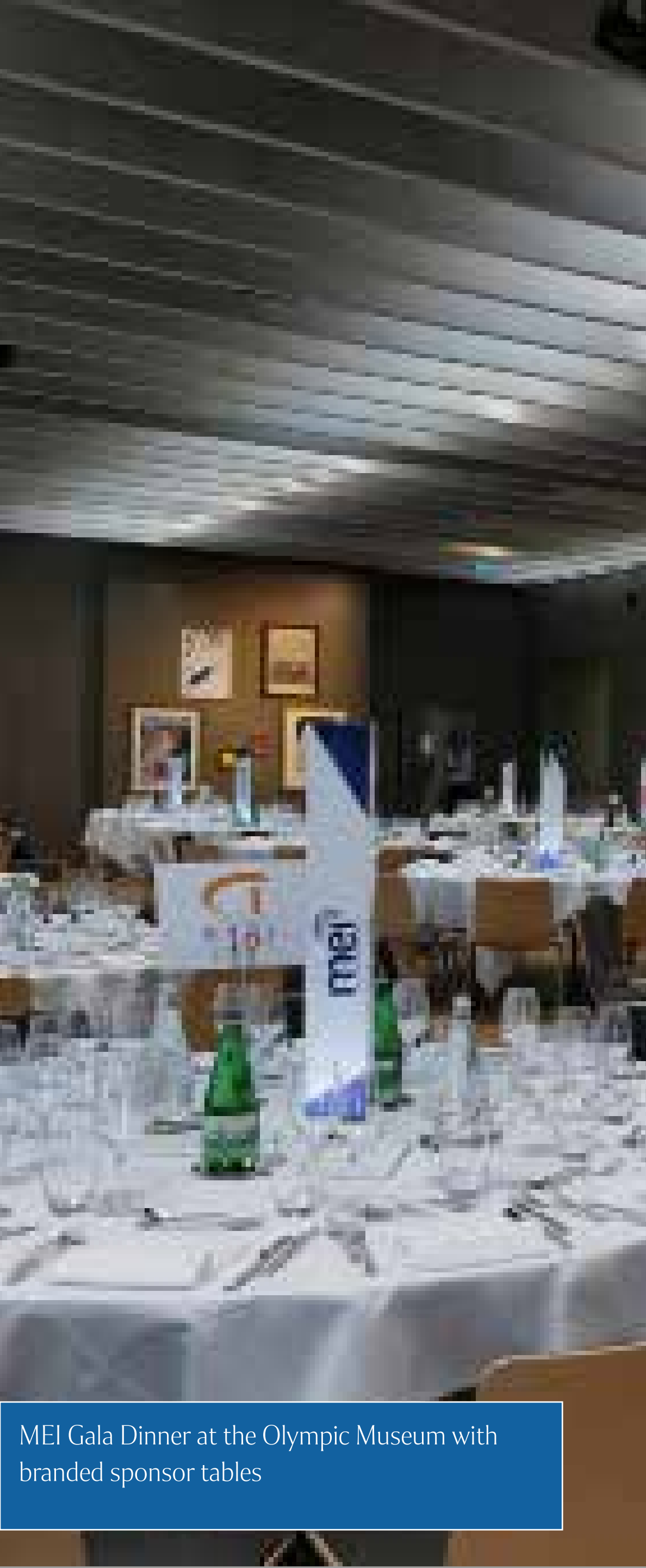
MEI Gala Dinner at the Olympic Museum with branded sponsor tables